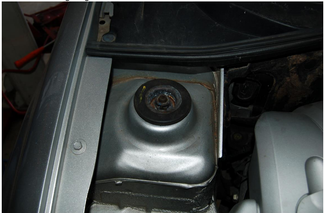
Jack up the vehicle, secure on axle stands and remove the front wheels. Remove:

With the vehicle still on the floor, remove the top nuts from the struts and screw them back on finger tight.